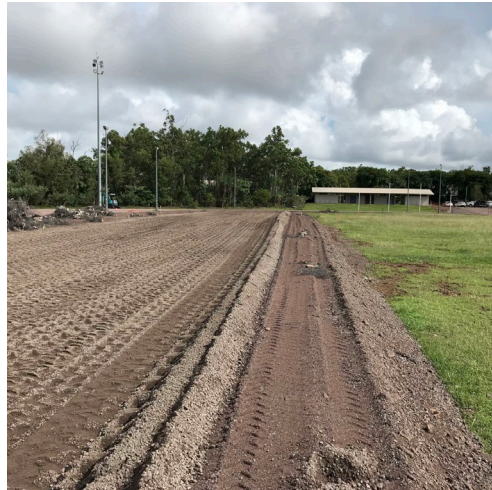
Pearson Oval demolition bitumen and light poles