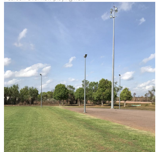
Pearson Oval new bitumen and light poles