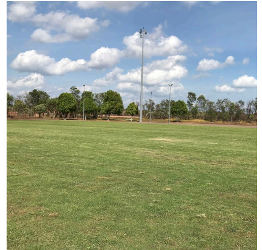
Pearson Oval new playing field