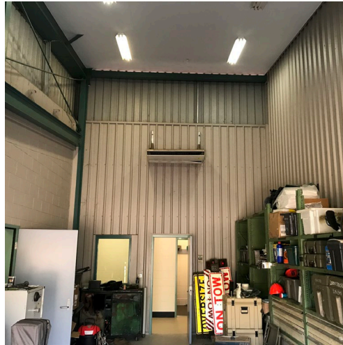
Petroleum Operations Cleaning Facility